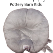
Pottery Barn Kids